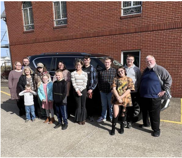
Spark & Youth groups delivering Valentines to our Faithful Friends...