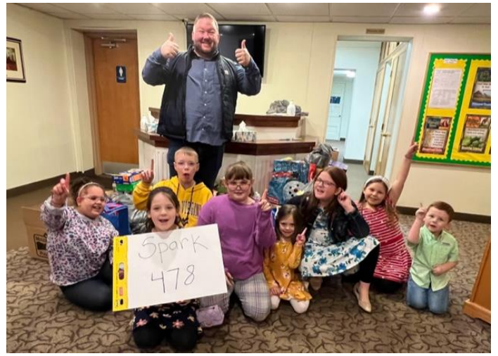
The SPARK kids celebrate winning the food drive over the Youth on Sunday, February 12th with 478 items collected