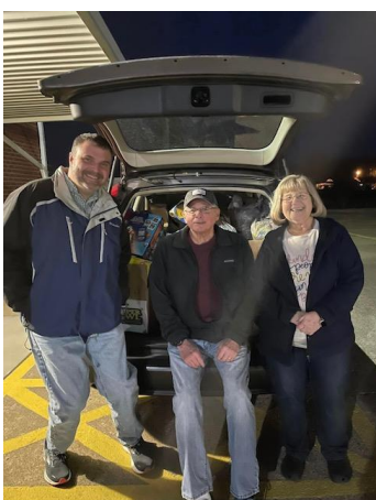
On Sunday evening (after the "pie in the face" ritual) the food was loaded up for delivery to the Food Pantry