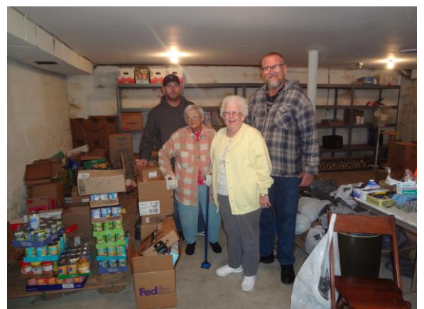
On Monday morning the food collected was taken to The Grace of God Food Pantry