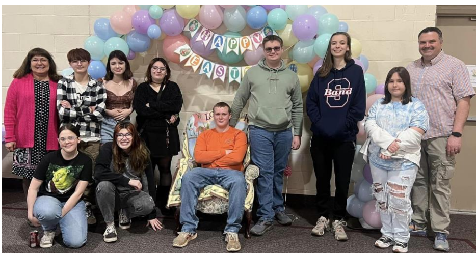
Fun, Good Food, & Fellowship were had by all at the Bunny Brunch & Easter Egg Hunt!!!