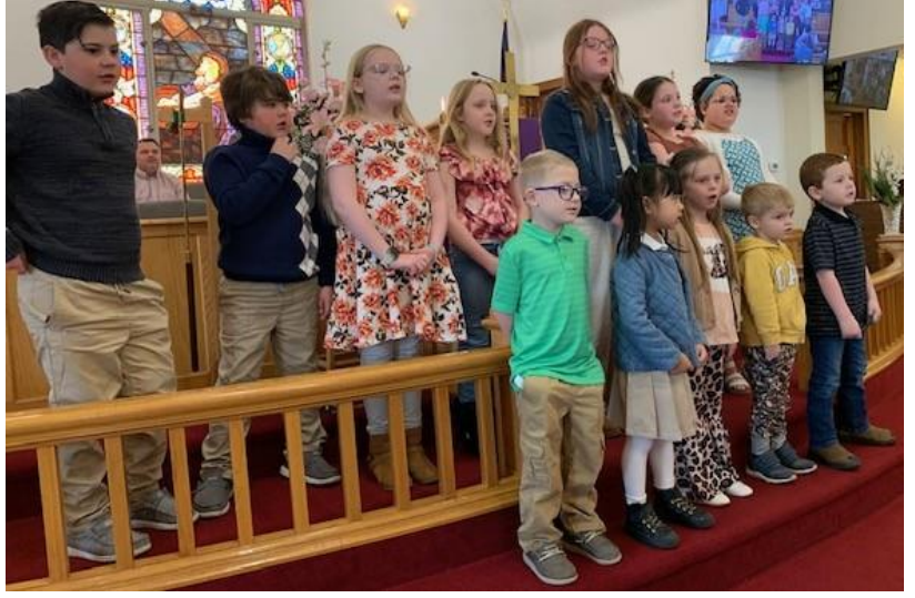
Parade of Palms through the Sanctuary & the kids singing